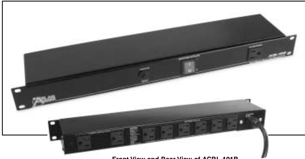
Front View and Rear View of ACRL-191B